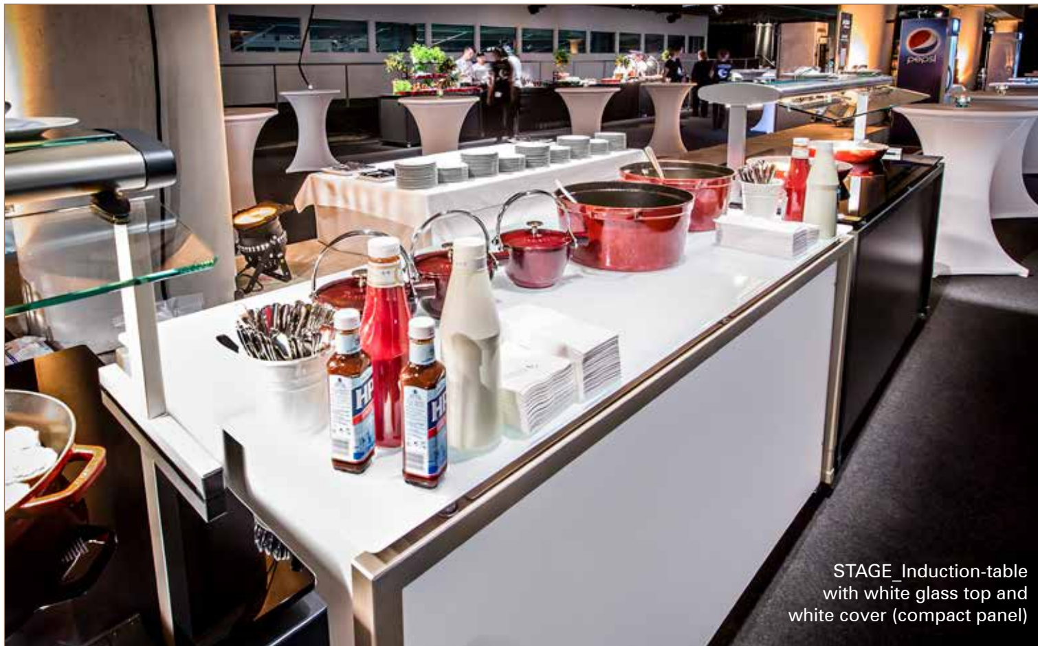
STAGE_Induction-table with white glass top and white cover (compact panel)