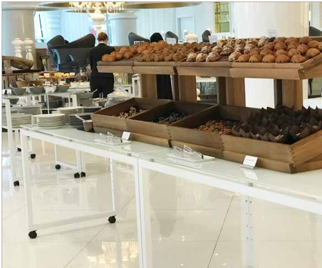
buffet solutions by VENTA