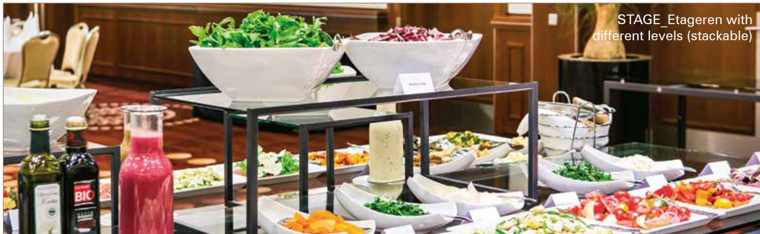
STAGE Etageren with different levels (stackable)