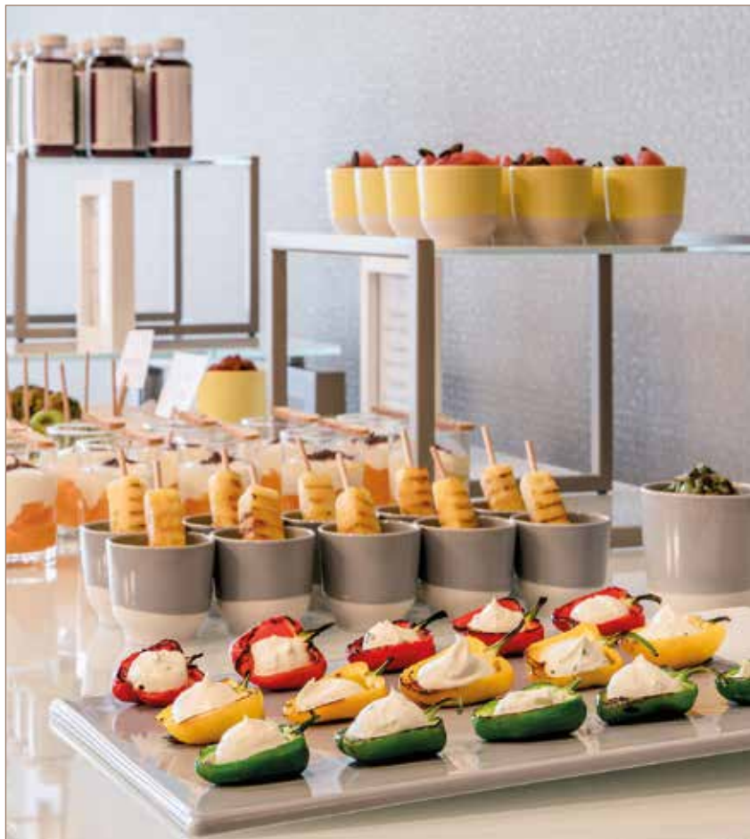
buffet solutions by VENTA