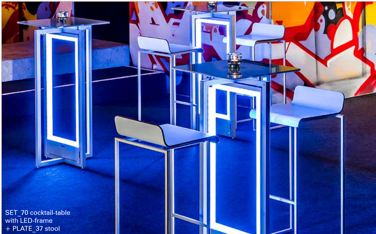
SET_70 cocktail-table with LED-frame + PLATE_37 stool

party location | tables with LED-frame (rechargeable battery)